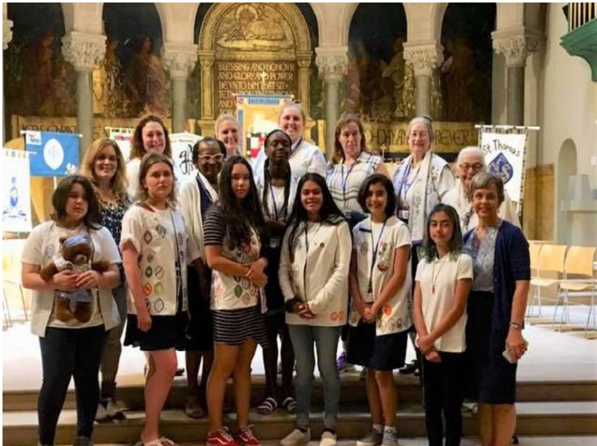
GFS-Los Angeles delegation to the National Assembly in Philadelphia in July, 2019