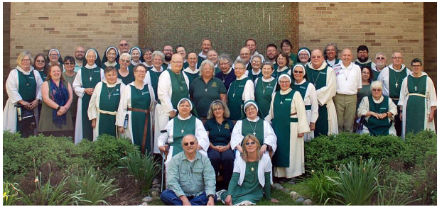
A Fellowship portrait - 2019

The Fellowship came into being in 2003. We are a dispersed community, vowed in obedience to our Rule of Life and subject to the ecclesial authority where we each live. We come together on an annual basis for retreat and to conduct Fellowship business. Those members who are part of a Priory ordinarily meet on a monthly basis. We strive for consensus in making decisions. Spiritually, our dedication is to the Holy Trinity.