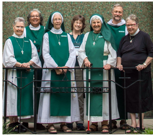
Iona Priory—Southern California

The Fellowship is a dispersed community of Brothers and Sisters living in their own homes, worshipping and serving in their own parishes and dioceses. We currently are arranged into Priory groups: